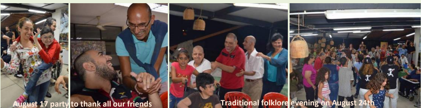
Traditional folklore evening on August 24th